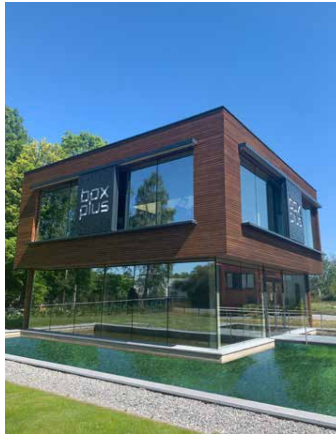
MAASEIK 51°0983909 N, 5°7837625 E